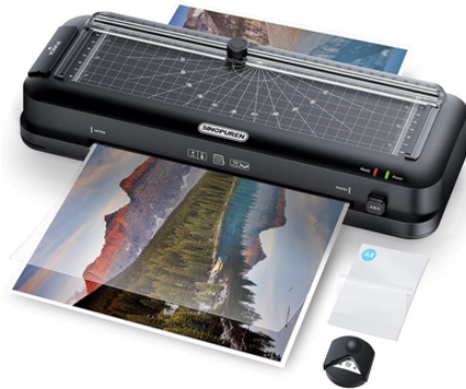
Our favorite laminators

Laminate before you punch your holes, or else you will have to punch holes twice