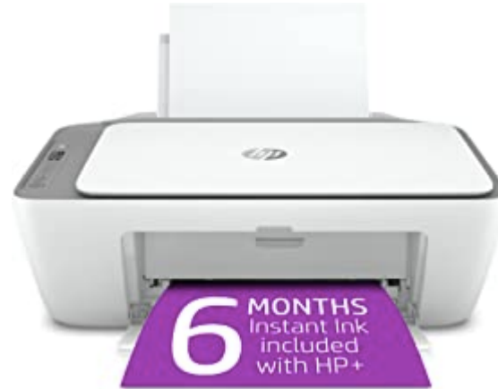
Our favorite printers